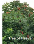
Tree of Heaven

Fruit has yellow capsules and is bright red when mature.