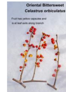
Oriental Bittersweet Celastrus orbiculatus

Common invasive plants in Indiana to watch or and eradicate!